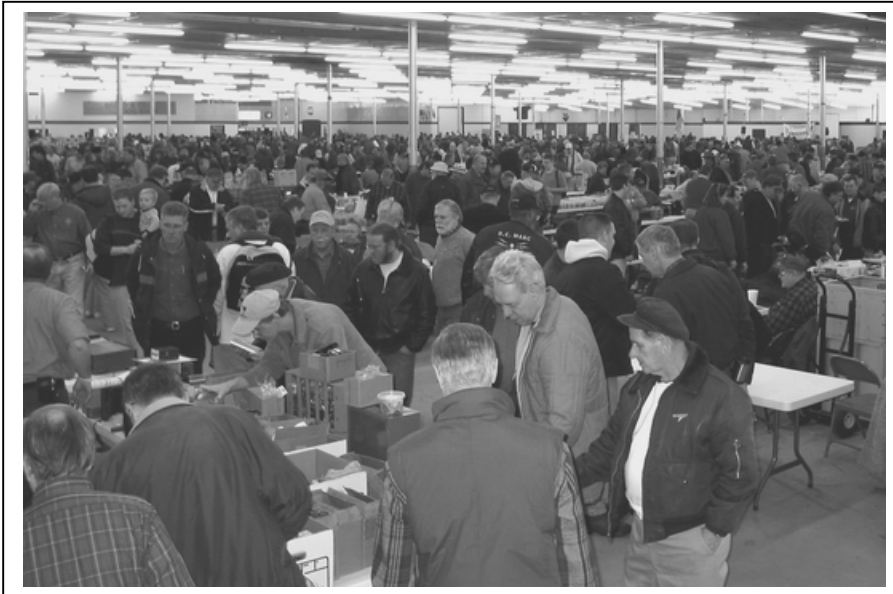
Ham crowd fills The Showplace for FrostFest February 9, 2003.

The Down East Hamfest Association will host a hamfest at the Lenoir County Fairgrounds on Fairground Road (Hwy 11 South) in Kinston, North Carolina. This will be from 8:00 AM until 3:00 PM on March 23 rd . For more information,